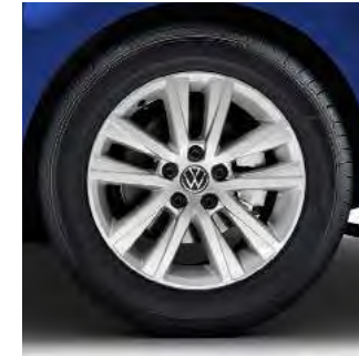
15" Estrada Alloy (Standard on Comfortline /Optional on Trendline)