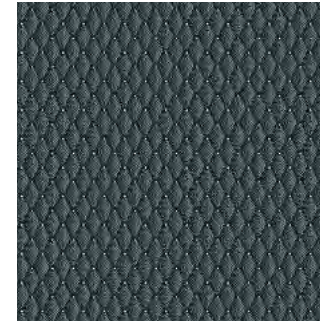
Cable (Standard on Highline)