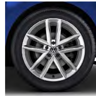
17" Mirabeau Hill Alloy (Standard on GT)