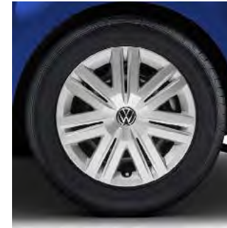
14" steel wheels (Standard on Trendline)