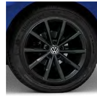
16" Portago Gloss Black Alloy (Optional on Comfortline and Highline with Black Style Package)