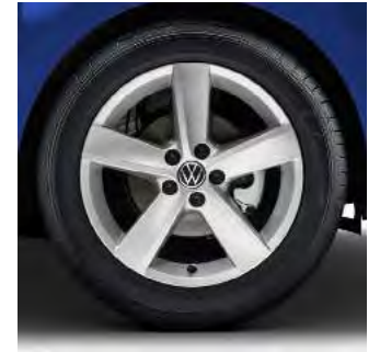
16" Rivazza Alloy (Standard on Highline /Optional on Comfortline)