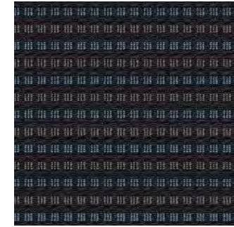
City (Standard on Comfortline)